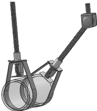
BRANCH LINE RESTRAINT NFPA13 2010 Section A.9.3.6.1(5)