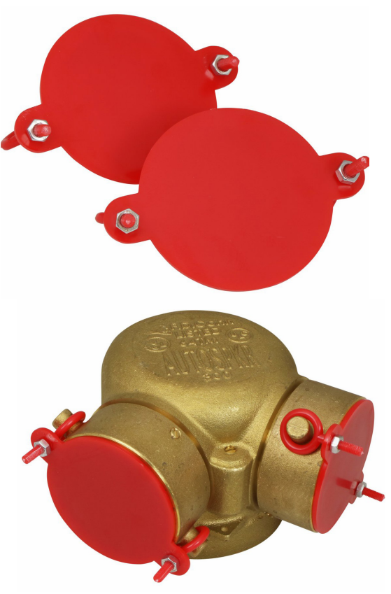
6510451: 2-1/2" plastic with Eye Bolts

Caution: Do not overtighten. The tabs of the break caps are designed to break with minimal force.